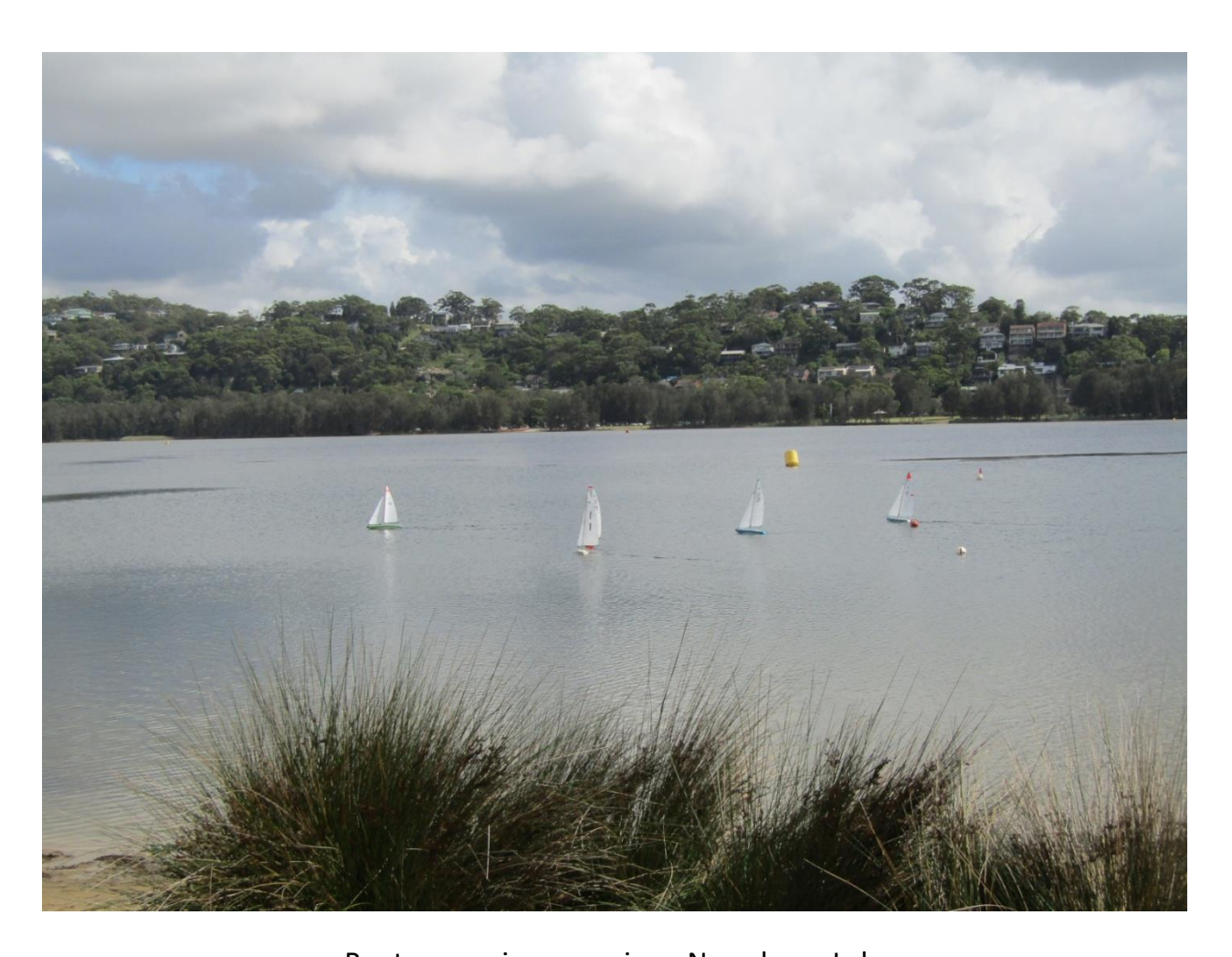
Boats come in many sizes: Narrabeen Lakes.