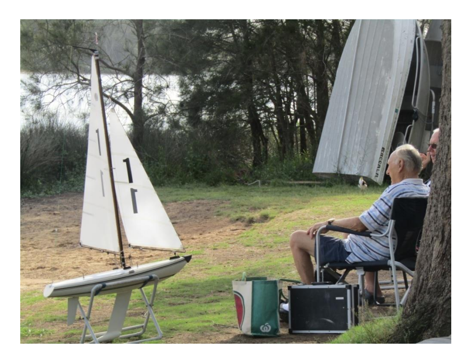
Narrabeen yachts part 2 (see front cover)