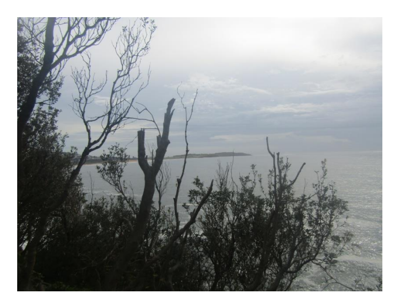
Long Reef from the walk

To commence at Dee Why go to the corner of Monash and Pacific Parades. The walk follows the coastline for 1.6kms to the car park of North Curl Curl RSL. Along the way there are lots of ups and downs and fantastic ocean views. There are safety rails along the way at the difficult points. Nearing the RSL the road forks. Take the left hand fork, Cobbers Way, if you want to reach the RSL or veer right to head back to Dee Why via the road. The track south from the RSL joins the Bicentennial Coastal Walk. At the north end of Dee Why beach the path reaches Dee Why lagoon. There is parking at each end of this walk or you can walk back via the same track for a different outlook. It's also simple to walk back along the roads but there is a quite large hill between Curl Curl and Dee Why.